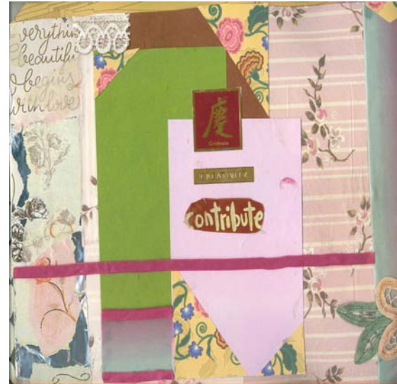
“Letter C” Alphabet Journal (Marney)