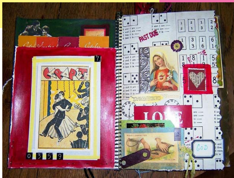
Background Journal (Deb)

13. Backgrounds Journal - Create a journal with the express intent of having extraordinary backgrounds to play on! Start by creating backgrounds and gathering backgrounds first, without any intention for what kind of art you'll eventually create on them. When you have an assortment of unusual, wonderful background pieces, bind them together. The example below shows a painted page and a page from a child's lesson book as just two of many fabulous pages, all bound together with a coil system from www.coilconnection.com .